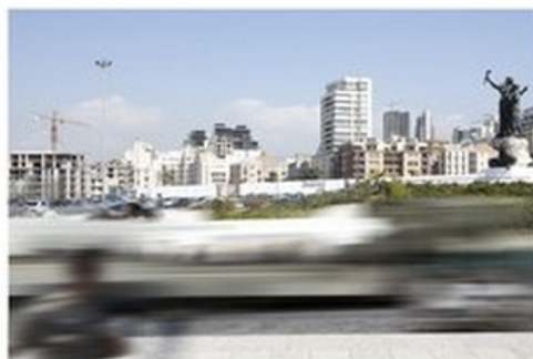
Joana Hadjithomas and Khalil Joreige, Restaged 5 , 2011, c-print, 72 x 100 cm, edition of 5.

JH: We always work on strategies inherent in images and how they are produced. Our work is of course very linked to the region but it has more to do with the medium we are using, we always reflect on what we use, photography, film, video, it's always part of how we work.