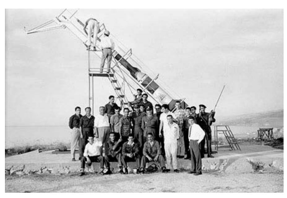
Photograph by E. Temerian of the launch of Cedar III, Dbayeh, Lebanon, 1962

a wall, which they would then wrap in the thread they had unravelled from their socks to turn them into a string of beads. The detainees, locked in a dehumanizing place, braved torture every day in order to create. They battled, thieved, lied or disobeyed to persevere, to create, moved by what could be called an artistic urge. And this is to be found in all places of arbitrary confinement. Whenever there is an attempt to enslave man, there is also resistance, disobedience, a surge toward art.