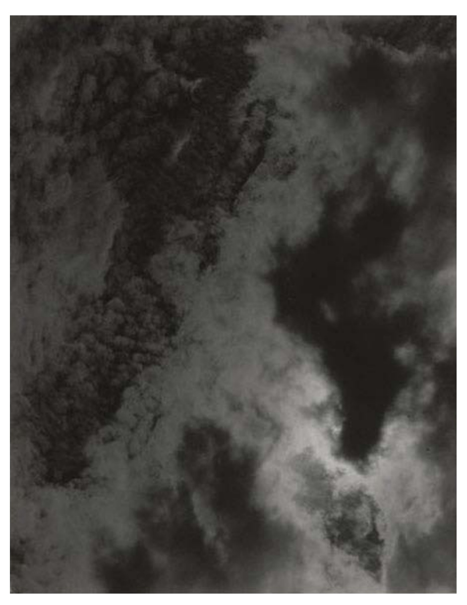
Alfred Stieglitz Equivalent 1925, from the series 'Equivalents', 1925-34, silver gelatin print

This postcard triggered our work. We did not study art or cinema; we began our artistic practice in the early 1990s in response to the violence generated by the Lebanese civil war, and the way it officially ended. It seemed to us that the war had been put between brackets, considered as an accident, and that things were not really resolved. The fact that these postcards reappeared on the stands of stationery shops as if nothing had happened, although the buildings they represented had been defaced or destroyed by the bombing, prompted us to reject the dominant and nostalgic image that annihilated our actual experience. That was the beginning of our Wonder Beirut project (1997–2006) and our production of postcards of war. Burning those images to make them correspond to our present life may be considered an iconoclastic gesture, or rather, as Bruno Latour described it, an 'iconoclash', but it's more about exploring the way history is being written and searching for images and representations we can believe in.