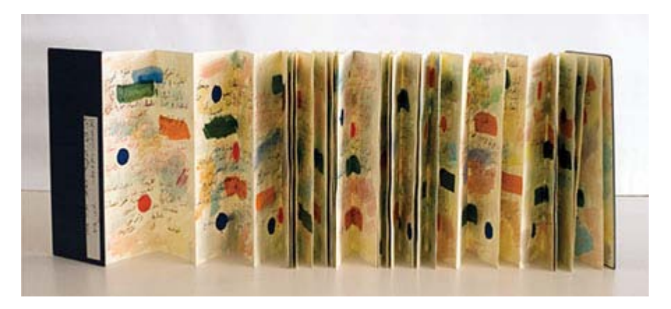
Etel Adnan Onsi El Haji 2004, accordion book