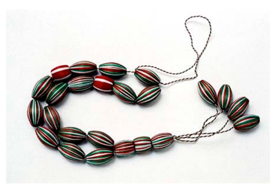
Objects of Khiam 1999, photograph of a string of beads made from olive stones and thread

Sometimes an image refuses to disappear. It comes back to haunt us. The picture that does not recede strikes us with its power and determination. It comes back to prevail upon us, as happened with the Super-8 film found in the belongings of Khalil's uncle, who was kidnapped during the Lebanese civil wars, his fate still unknown. The film was found 15 years after his uncle's disappearance, still packed in its yellow bag, waiting to be sent to the laboratory for development. After hours of work, the whitish representations, altered by time, revealed a few recognizable shapes, some sites, some faces, some lasting pictures.