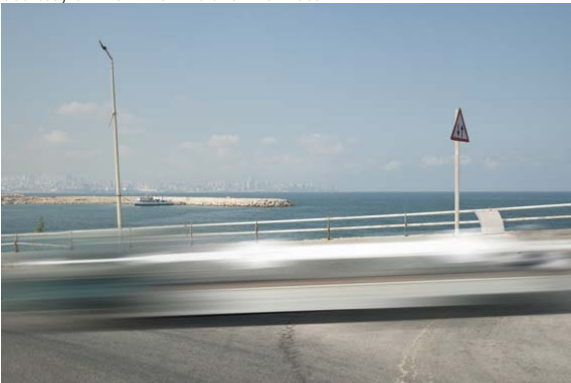
Hadjithomas & Khalil Joreige / Restaged, 2012, C print, Size in 100 x 72 cm